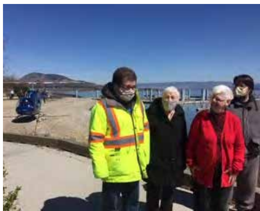
Activity Service West Kelowna are out enjoying the activities in their community.