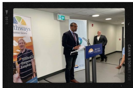
B.C. Housing Minister Ravi Kahlon speaks at Hadgraft Wilson Place https://www.kelownacapnews.com/news/kelowna-mayor-housing-minister-champion-low-cost-and-supportive-housing/