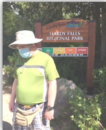
Gellatly Nut Farm and Hardy Falls